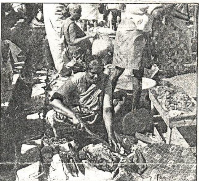
Fig 1 : A sales woman is cutting the head of Leatherback turtle at Kattakada fish market

The turtle was butchered and packed in 3 bamboo baskets with sufficient ice for marketing at Kattakkada market, 20km