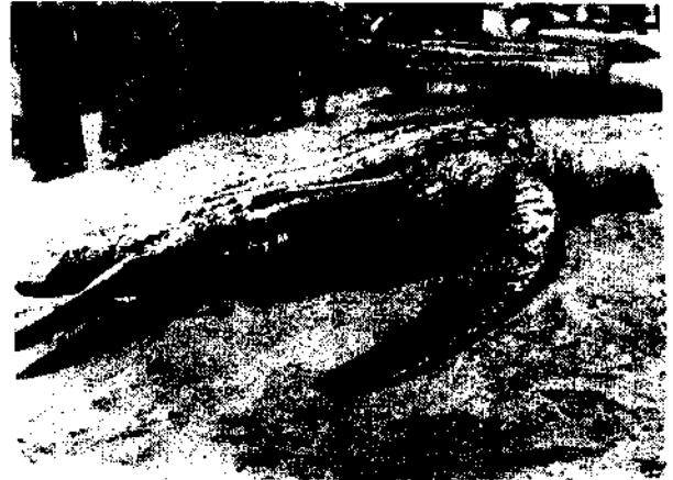
Fig. 1. Ventral view of the leatherback turtle caught off Colachel on 3-8-1991.

The turtle was auctioned for Rs. 750/- at the beach and transported to a nearby market for disposal of its flesh in fresh condition for human consumption.